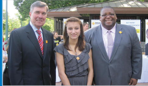
caption goes here