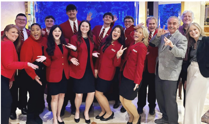
FCCLA's National Leadership Council and NRSF